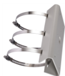
Vertical pole mount DS-1275ZJ